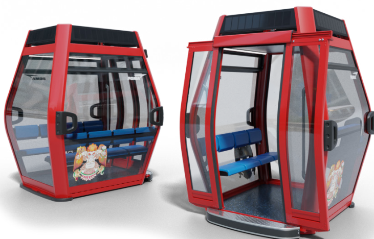
Cabins - exterior

The line extending 6 km will have 3 stations, with 122 cable cars running between the Ger districts north of the city and the city centre. This corridor is in full alignment with the development programmes currently underway, as this Ger district was targeted as a priority for the redevelopment and densification programme financed by the ADB. (Asian Development Bank)