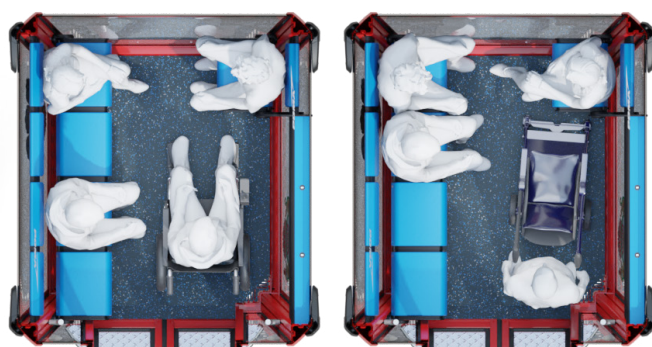
Cabins - interior