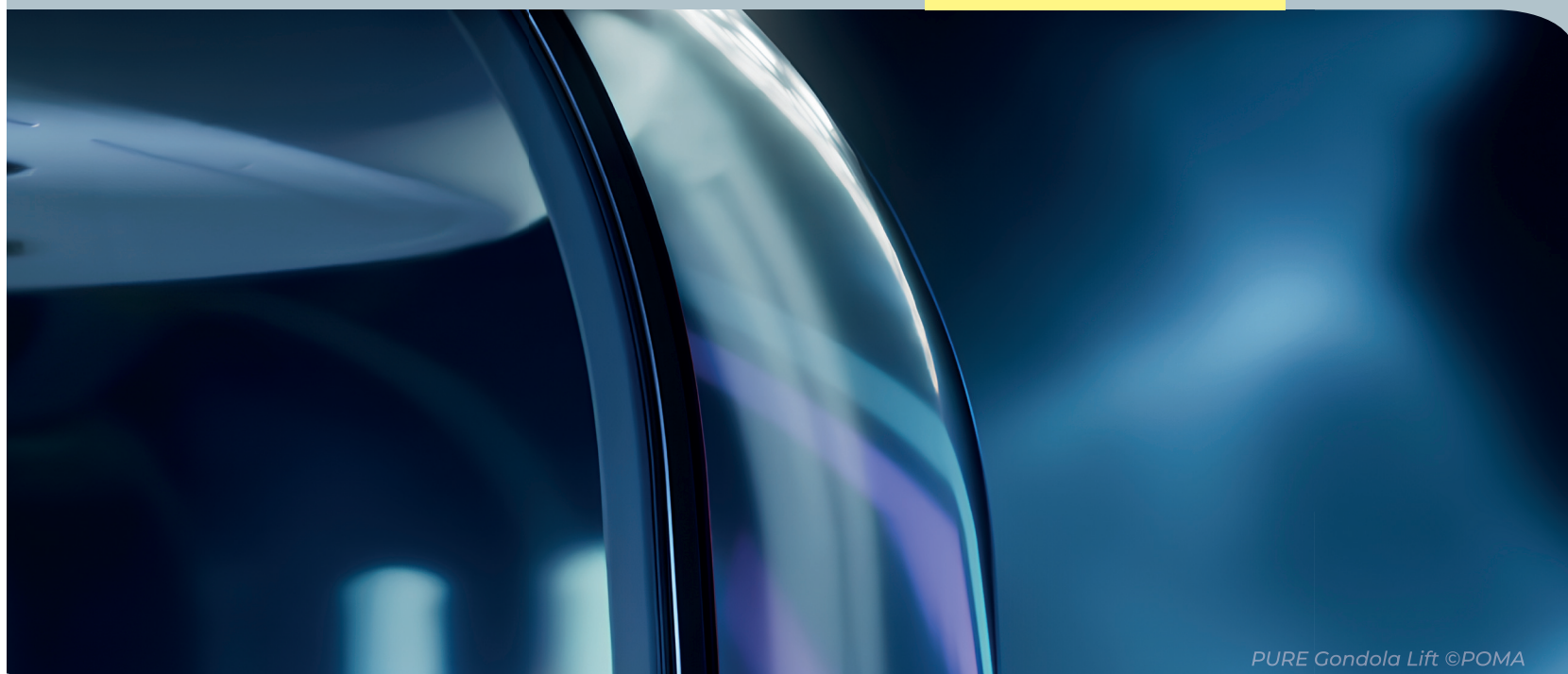
PURE Gondola Lift

On the occasion of the Mountain Planet trade show, POMA unveils its latest creation: the PURE cabin. Drawing on 90 years of French expertise, it is designed to enhance the travel experience. The latest addition to the LIFE range-a new generation of cable transport systems-PURE follows in the line of POMA's strategic innovations aimed at delivering ever more high-performance, sustainable and universal solutions. With cutting-edge product innovation and increasingly comprehensive services to support operations and maintenance, POMA is fully committed to supporting cable transport operators and territories as they address their development challenges.