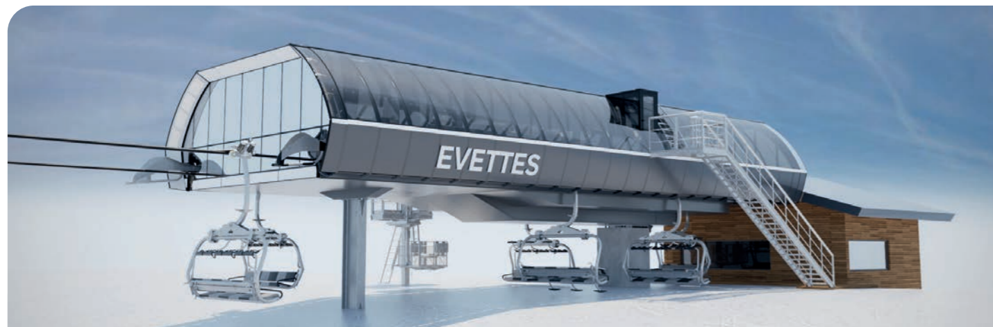
EVETTES - CHAMONIX, France 6-Passenger Chairlift

The replacement of the Évettes chairlift marks a major milestone for the Compagnie du Mont-Blanc (CMB), which is making a structured investment based on three key priorities: improving operational performance, strengthening environmental leadership, and delivering a technically demanding project in a high-mountain environment. This aging installation is being replaced by a modern detachable six-seater chairlift (D-Line), in line with current standards for comfort, safety, and reliability . As a mission-driven company, CMB pays particular attention to landscape integration, energy efficiency, and the long-term sustainability of its equipment. To meet these requirements, the new Évettes chairlift is equipped with the LIFE range , designed to reduce environmental footprint through eco-designed, energy-efficient solutions incorporating recycled or bio-based materials. This project is also part of a broader multi-year program. The Trappe and Autannes chairlifts will likewise be replaced by LIFE-range detachable six-seater chairlifts, ensuring technical and environmental consistency across the entire sector.