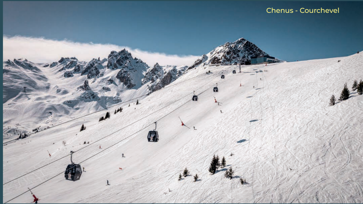
Chenus - Courchevel