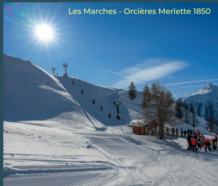
Les Marches - Orcières Merlette 1850