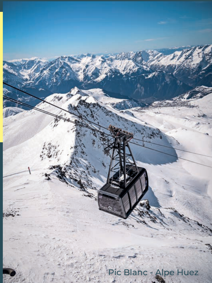
Pic Blanc - Alpe Huez