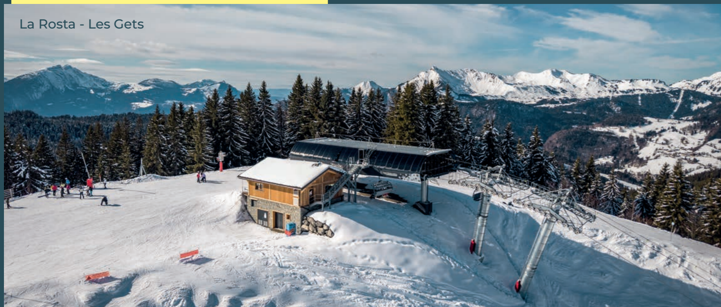
La Rosta - Les Gets