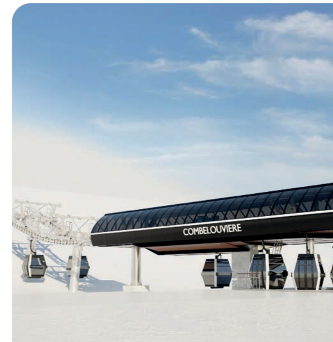
COMBELOUVIERE - VALMOREL, FRANCE 10-Passenger Gondola Lift

The replacement of the Évettes chairlift marks a major milestone for the Compagnie du Mont-Blanc (CMB), which is making a structured investment based on three key priorities: improving operational performance, strengthening environmental leadership, and delivering a technically demanding project in a high-mountain environment. This aging installation is being replaced by a modern detachable six-seater chairlift (D-Line), in line with current standards for comfort, safety, and reliability . As a mission-driven company, CMB pays particular attention to landscape integration, energy efficiency, and the long-term sustainability of its equipment. To meet these requirements, the new Évettes chairlift is equipped with the LIFE range , designed to reduce environmental footprint through eco-designed, energy-efficient solutions incorporating recycled or bio-based materials. This project is also part of a broader multi-year program. The Trappe and Autannes chairlifts will likewise be replaced by LIFE-range detachable six-seater chairlifts, ensuring technical and environmental consistency across the entire sector.