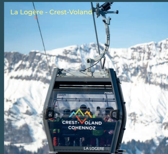
La Logère - Crest-Voland