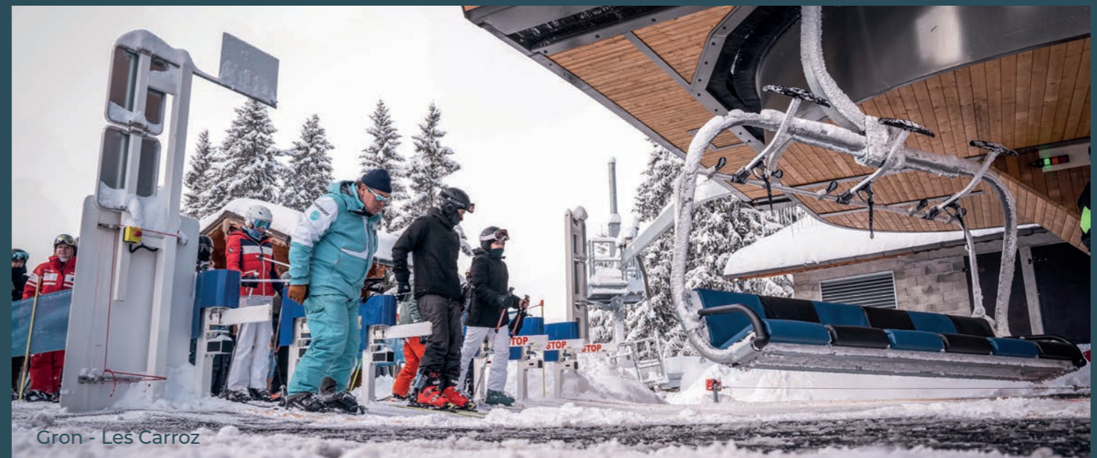
Gron - Les Carroz