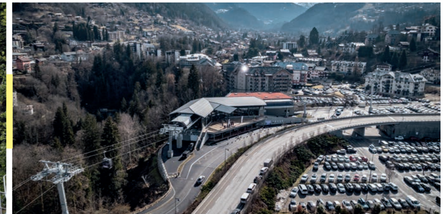
LE VALLÉEN, L'ALPIN, ST-GERVAIS THERMAL ELEVATOR, France

Two 10-seater detachable gondola lifts and an ecological inclined elevator