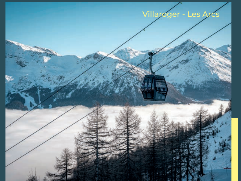
Villaroger - Les Arcs